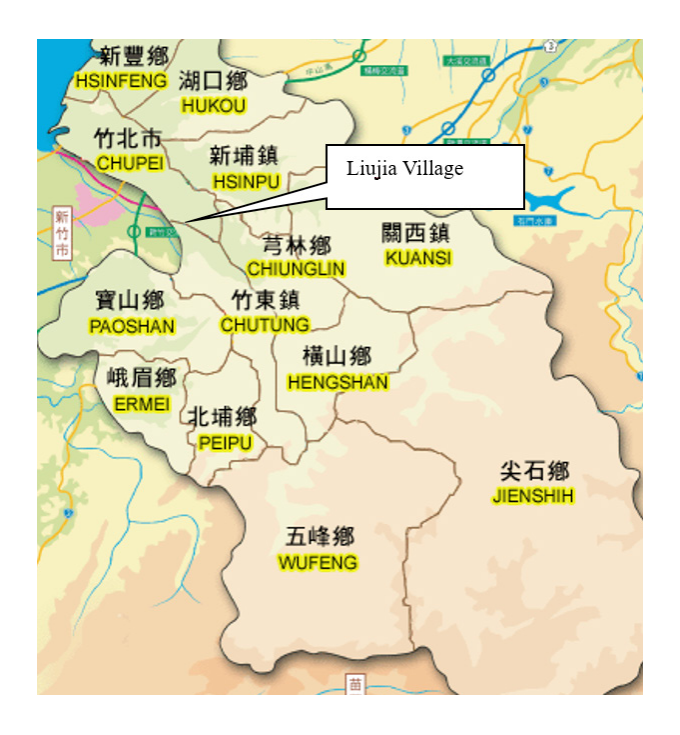
Figure 1 Map of Hsinchu County and the location of Liujia Village

Hakka people today constitute over 70% of the population in Hsinchu County. Other ethnic groups include Minnan people, aborigines and new immigrants.